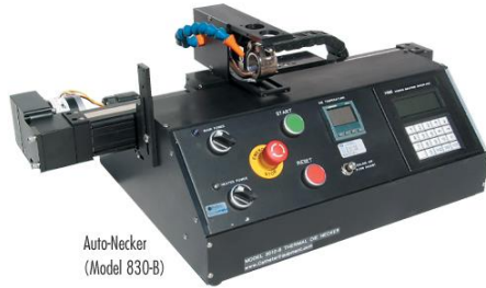
Auto-Necker (Model 830-B)

These bench-top systems are designed to draw down the outer diameter and/or inner diameter of single or multi-lumen catheter tubing on a variety of tubing sizes and materials, such as PE, PA, PTFE and PEEK. Common applications include: Catheter Shaft Neck Down, Heat Shrink Tubing Sizing, polymer tubing layering, and tubing jacketing (i.e. S.S. hypo tube shafts or wire braids with polymer tubing).